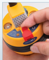
EPIRB keys with protective tab