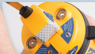
High intensity strobes

The retractable antenna provides maximum protection and a reduced outline for stowage. When required the antenna is easily deployed with a gentle pull.