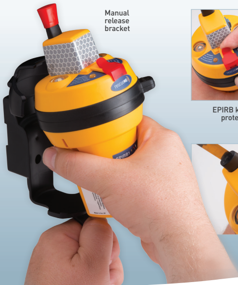
Manual release bracket

A simple protective tab over the operating keys prevents inadvertent activation, yet allows for easy operation when required. The rescueME EPIRB1 also features two high brightness strobes to maximise visibility in low light conditions.